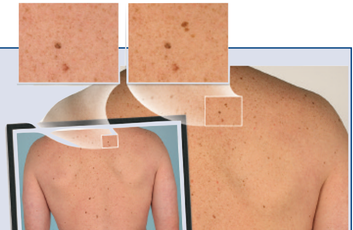
DermaTraks print books provide a baseline for detecting changes over time.

TBP is a proven method of monitoring individuals who may be at risk of developing melanoma, and dermatologists have found it to be a useful adjunct to the treatment of these patients. Since most practices do not have the resource to provide this service on site, knowledgeable physicians most often refer their patients to an out-