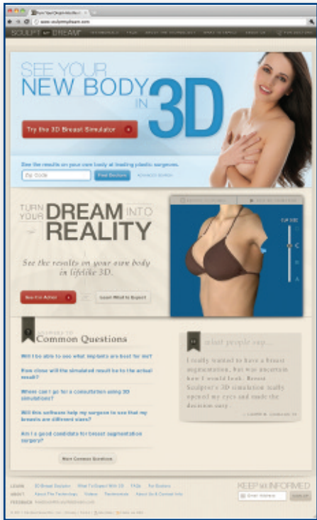
The home page offers fast access to all the website's features.

SculptMyDream.com, an innovative new website for prospective plastic surgery patients, offers 3D aesthetic simulation, educational content and a doctor locator service. Now, women considering breast augmentation can select actual 3D photographs of body types similar to their own and create interactive simulations of various implant scenarios. This provides a unique opportunity for patients to explore the possibilities of these procedures and to select a local practitioner who can meet their needs and expectations.