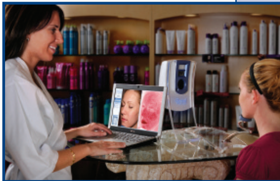
Facial imaging systems can make a big difference in your aesthetic consultations.

First introduced in 2008, Reveal provides skin care professionals with powerful visual communication tools for more productive client consultations. Reveal includes an extensive library of product recommendations which can be customized to the product and service offerings of each aesthetic practice. Canfield system owners with current Support & Upgrade agreements automatically receive new software releases as an upgrade at no charge. •